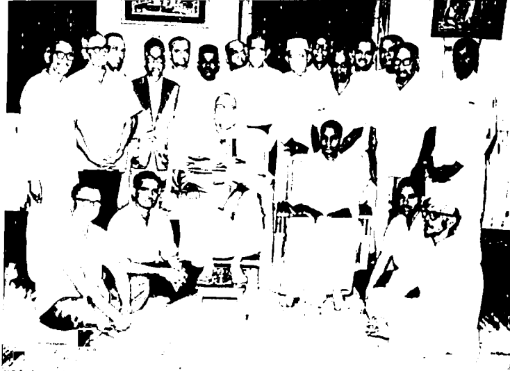
Shishya Sweekar Samiti 1967