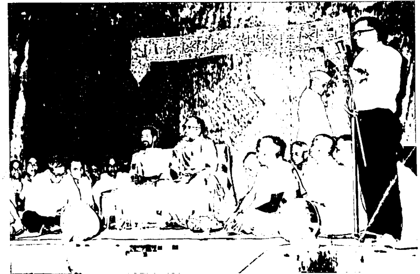
Shreemat Dwarakanath Teerth Swamiji with Shree Pejaware Math Swamiji